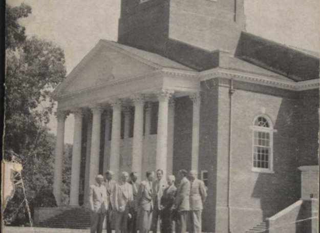
Wake Forest, North Carolina

THE SOUTHEASTERN BAPTIST THEOLOGICAL SEMINARY