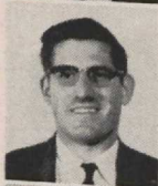
Clyde Franklin High (2)