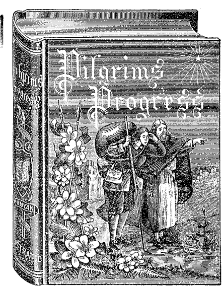
EARLY RELIGIOUS LIFE

The work is printed from clear, new type, and comprised in one Octavo volume of 548 LARGE PAGES. It is splendidly embellished with about 130 fine engravings; including a steel plate portrait of the anthor and 16 engravings in tunts. Bound in Fine Silk Cloth, Plan Edges, $2.00.