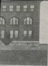
AS CITY, MISSOURI.