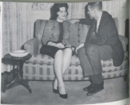
Entertaining in the Manor House.