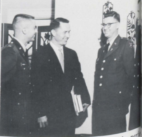
"That the man of God might be perfectly furnished unto all good works."