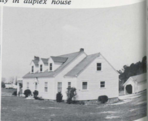
Others live in personages