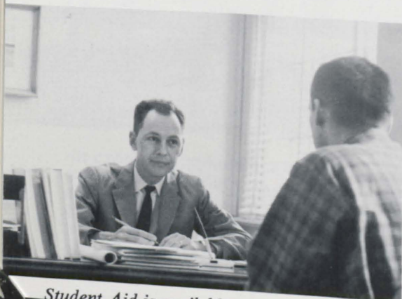
Student Aid is available in emergencies.