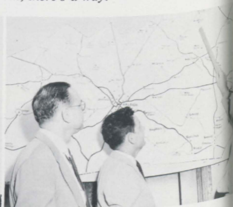
This might be your place.