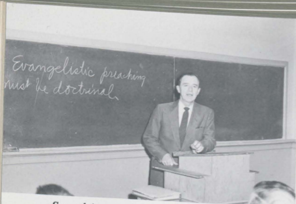
Sound instruction under competent teachers.