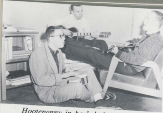
Hootenanny in bachelor's quarters.