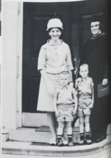
THE BIG DAY