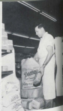
Where there's a will, there's a way.