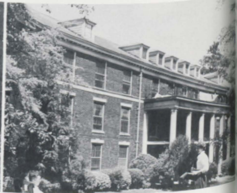
Apartments for married students.