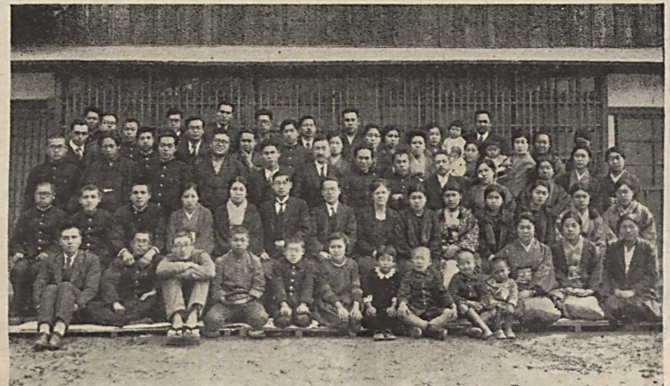
YAWATA BAPTIST CHURCH — MARCH, 1934