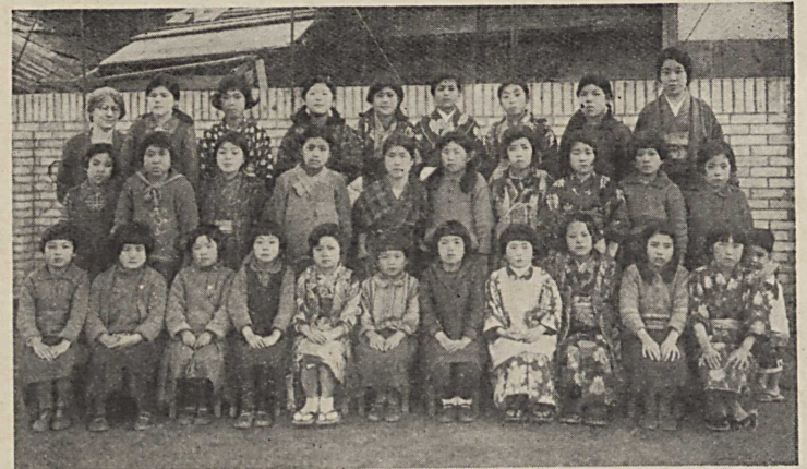
THE BLOSSOM SHOP CLUB OF THE BAPTIST GOOD WILL CENTER, TOBATA, JAPAN