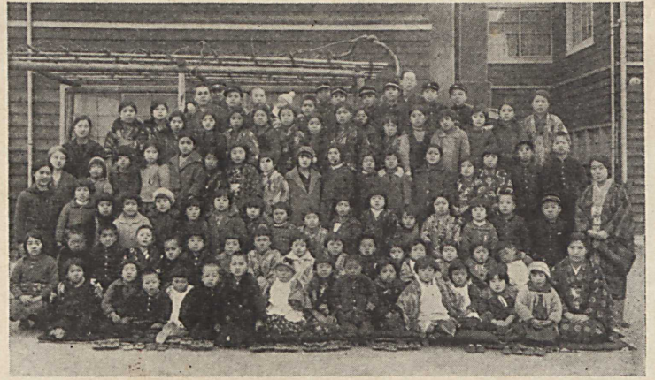
GOOD WILL CENTER SUNDAY SCHOOL, TOBATA, JAPAN