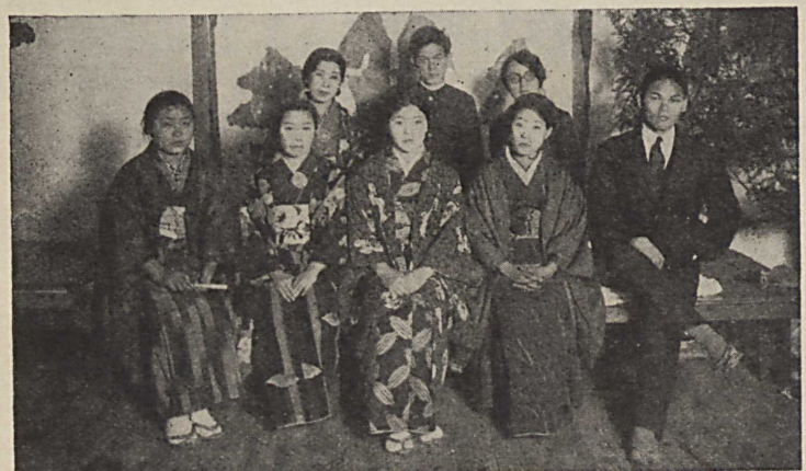
SEINAN COLLEGE STUDENTS WHO HELPED WITH THE VILLAGE HALL CHRISTMAS PROGRAM — 1932