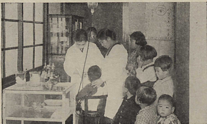
CLINIC AT BAPTIST GOOD WILL CENTER, TOBATA, JAPAN