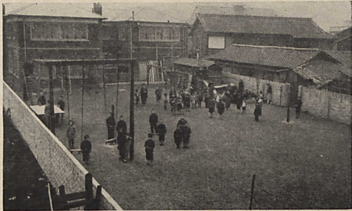
SUPERVISED PLAYGROUND OF GOOD WILL CENTER, TOBATA, JAPAN