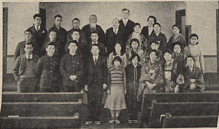
HIROSHIMA BAPTIST CHURCH — PASTORS, OFFICERS, AND NEW MEMBERS — 1933 New Auditorium — seats 200.