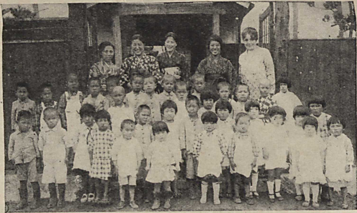
THE FIRST KINDERGARTEN OF AI NO SO NO (GARDEN OF LOVE) — 1931